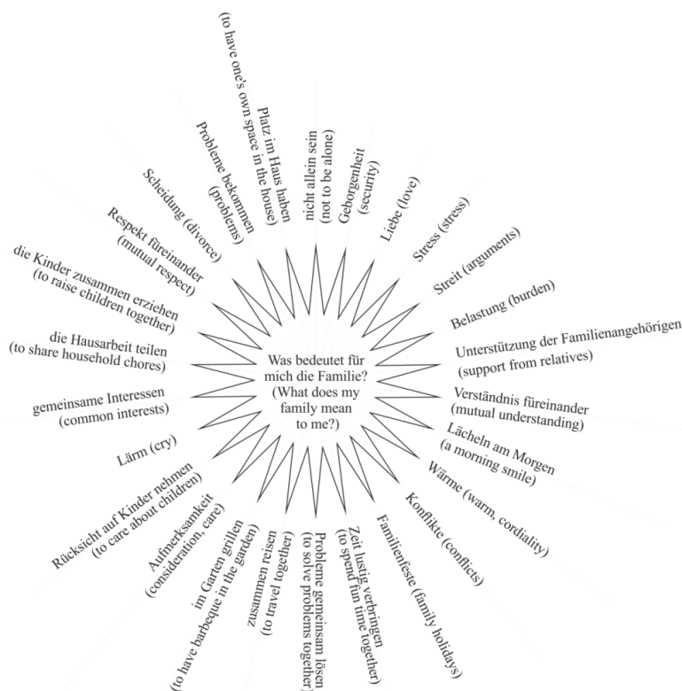
Fig.1. Example of “The Associations Star”

“The Associations Star” can be used in the following way. This is an example of the technique used for studying the topic “Familie” (“Family”) in the process of learning the German language: