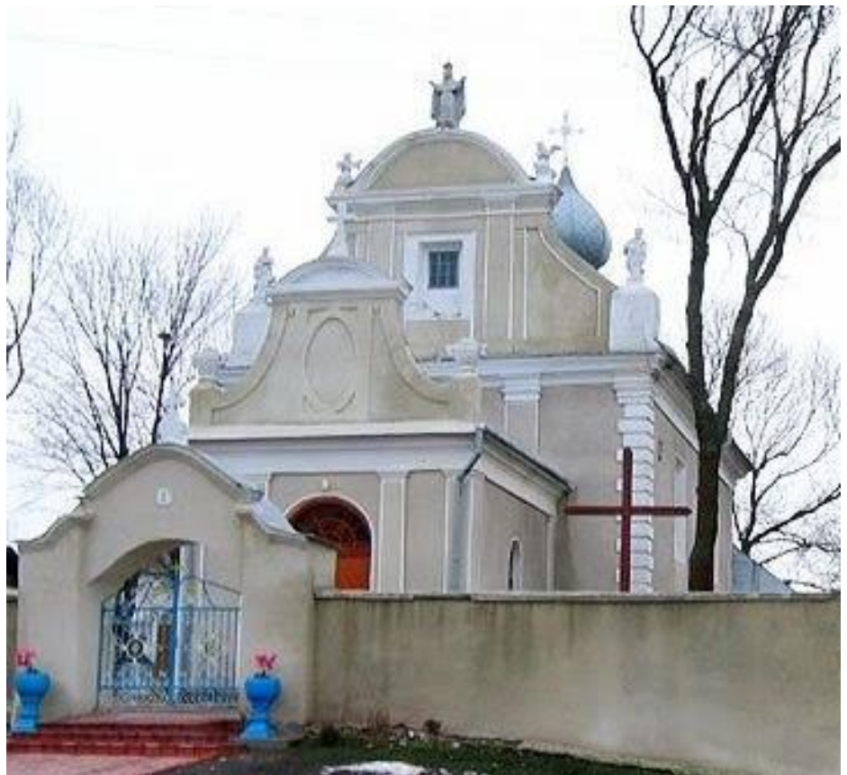
Fig.2. Church of the Protection of the Virgin Mary in the village of Grimayil: 1 - the old image of the Trinitarian church; 2 - the current state of the Pokrovsky church.