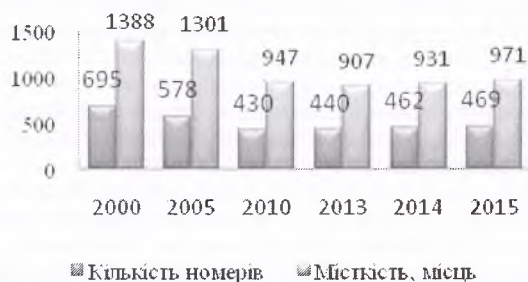
Fig.3 The number of rooms and their capacity in hotels and similar facilities of the city of Ternopil.

For a more accurate assessment of the hotel industry in the city of Ternopil one should consider the indicators of the number of rooms and their capacity in hotels (see Table 1)