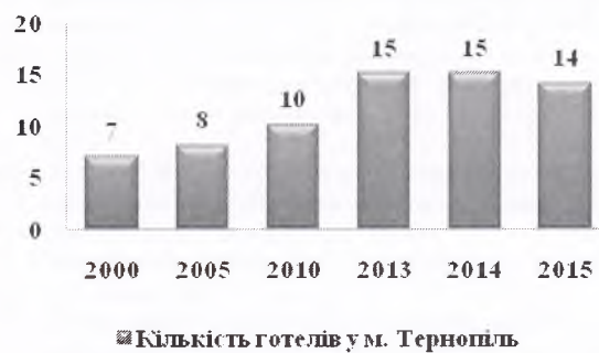
Pic.1 Hotels and similar establishments in Ternopil

Unfortunately, the condition of most hotel service objects remains at a level far from world standards. The list of additional hotel services is much more modest, which does not allow us to fully utilize the existing potential. Coefficient of capacity utilization of hotel enterprises in 2015 was 0.19 (in 2010 - 0.18). Utilization rate coefficient is calculated as the ratio of the number of nights to the number of places of accommodation, multiplied by the number of days of collective accommodation facilities. Revenues from the operation of hotels and other places of temporary residence in 2015 constituted 14.7 million UAH, which is 25.0% less than in 2010.